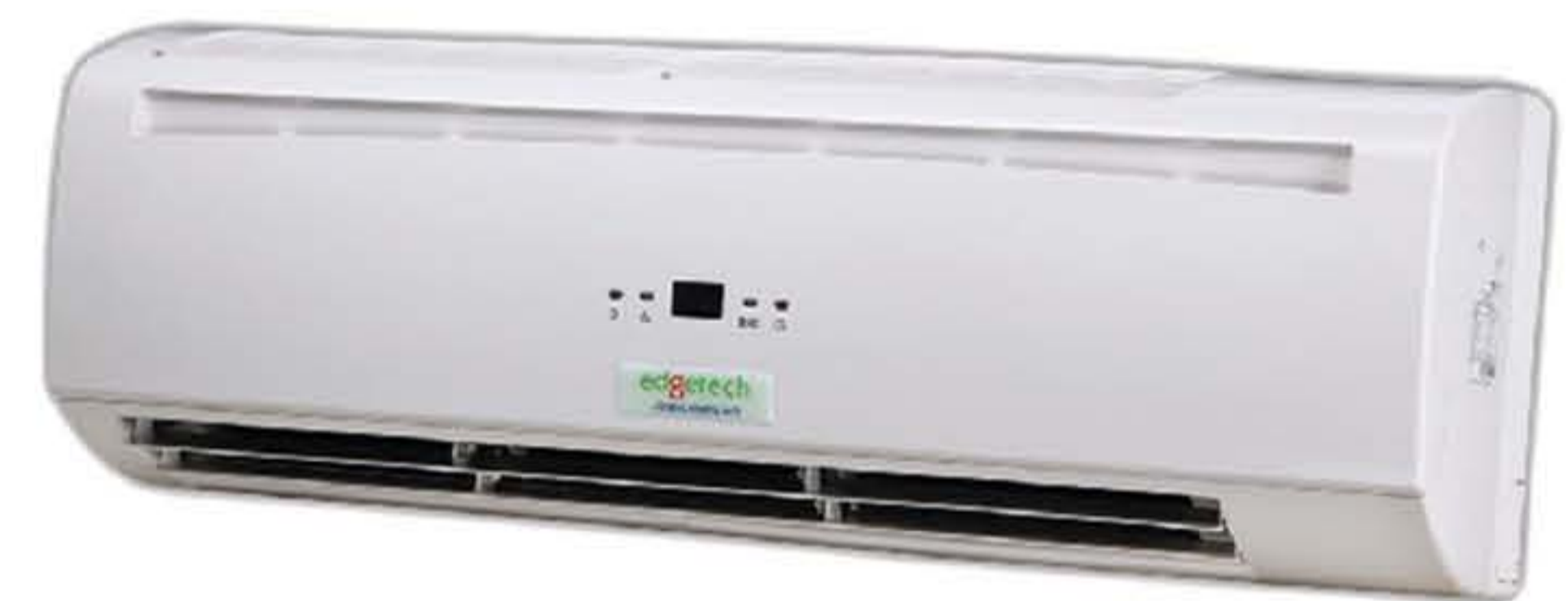
High Wall Fan Coil Unit