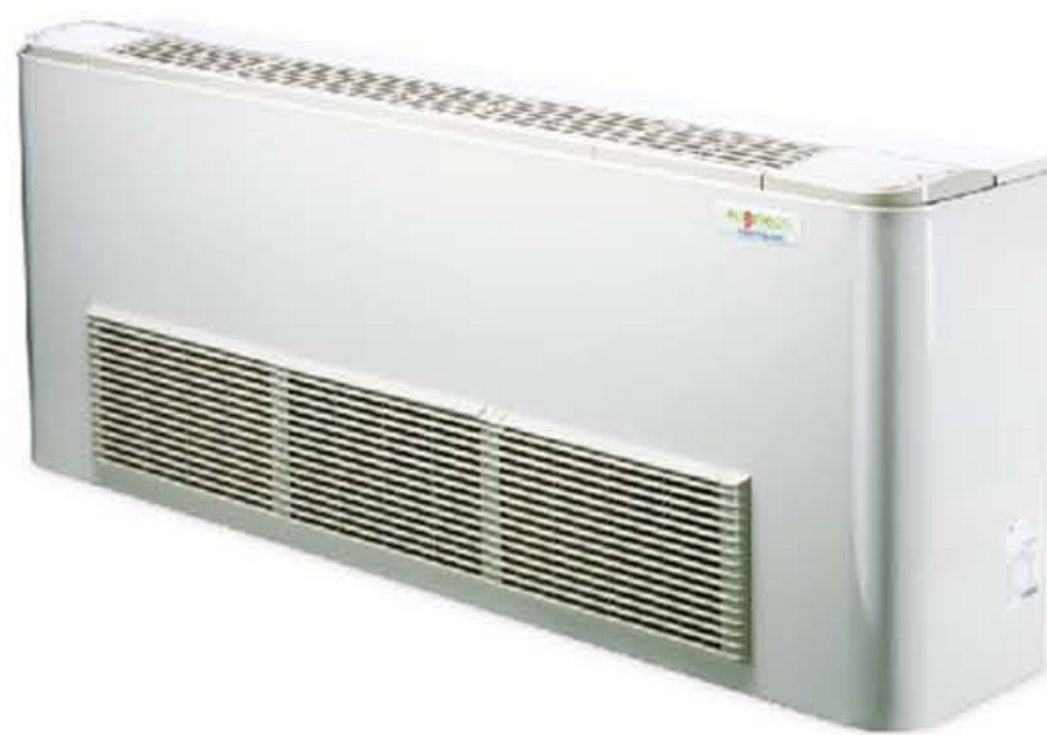
Universal Fan Coil Unit