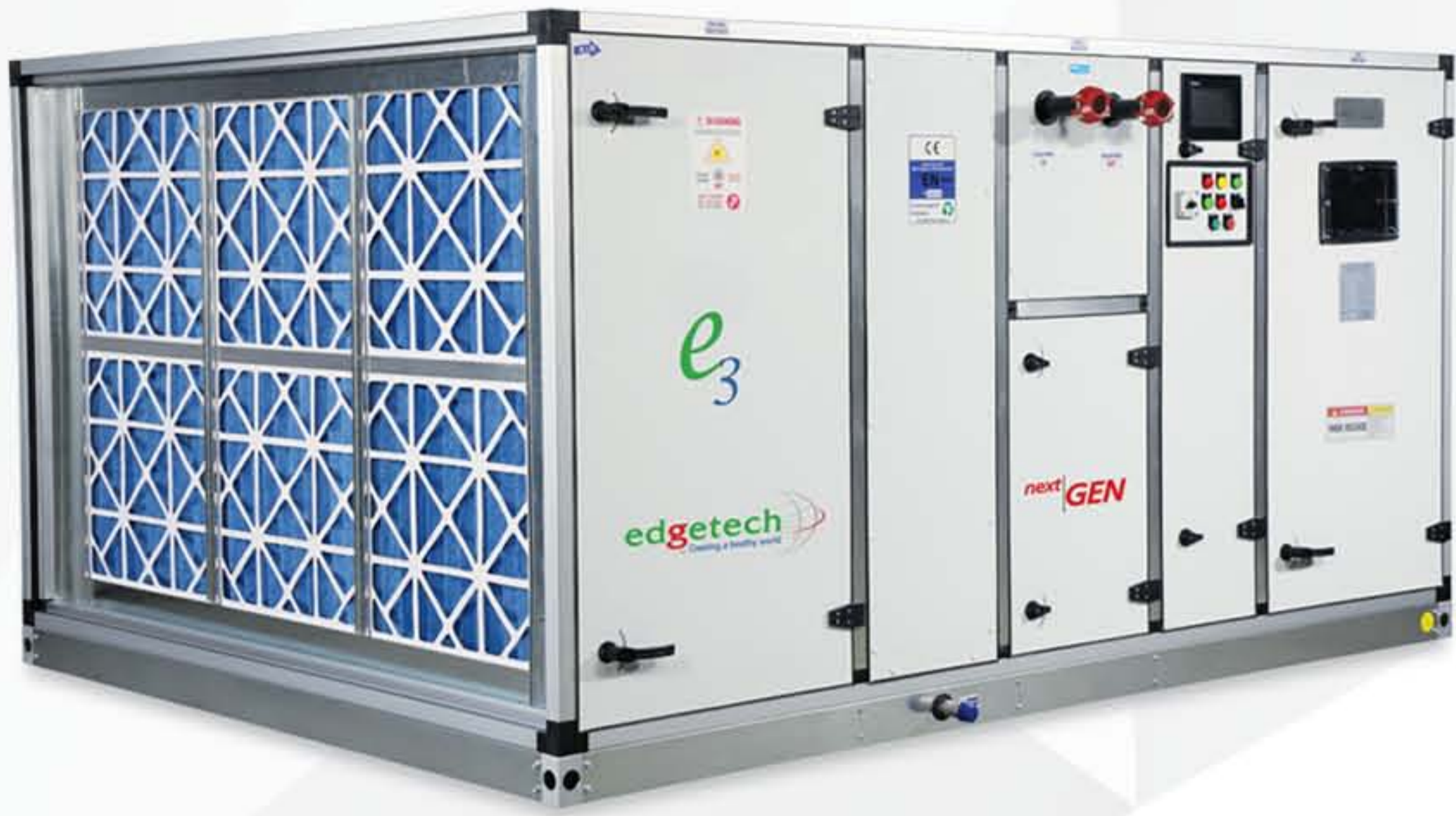
Smart Air Handling Unit