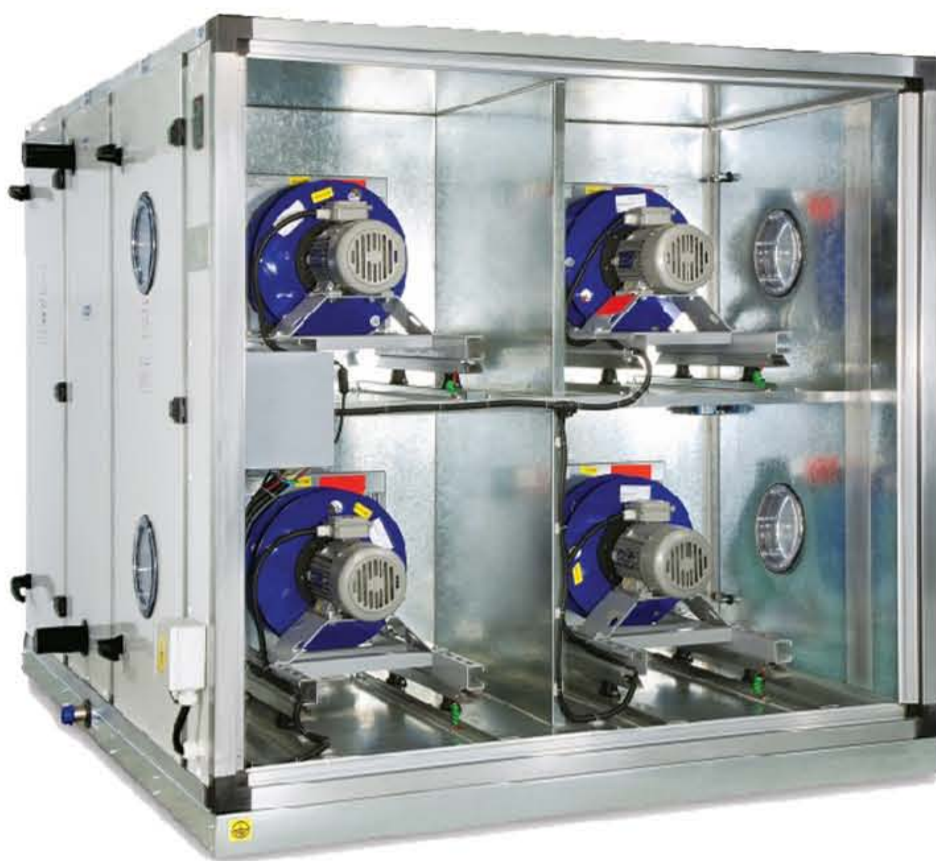
Fan Wall Arrey