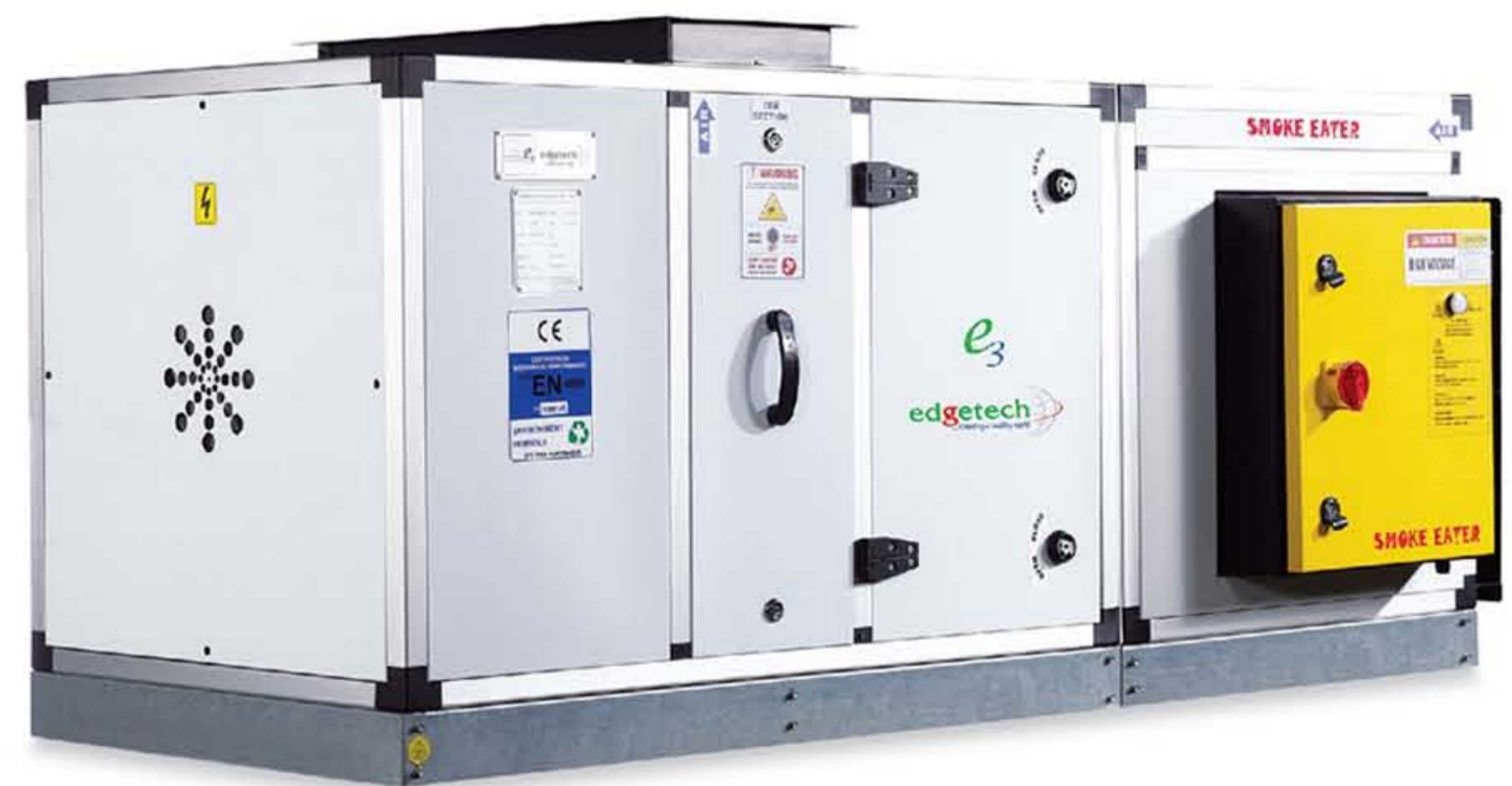
Kitchen and Hot Air Systems