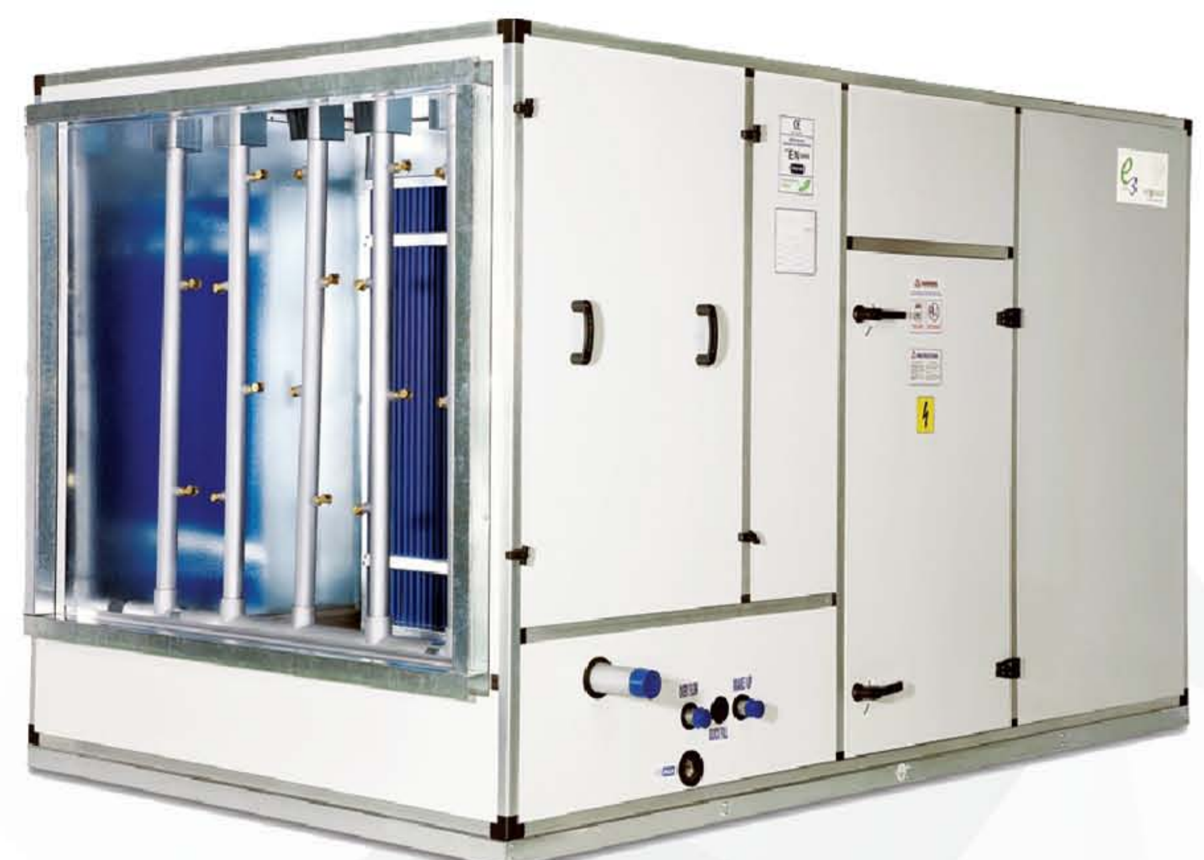
Evaporative Cooling Unit Spray Type - Single / Double Bank