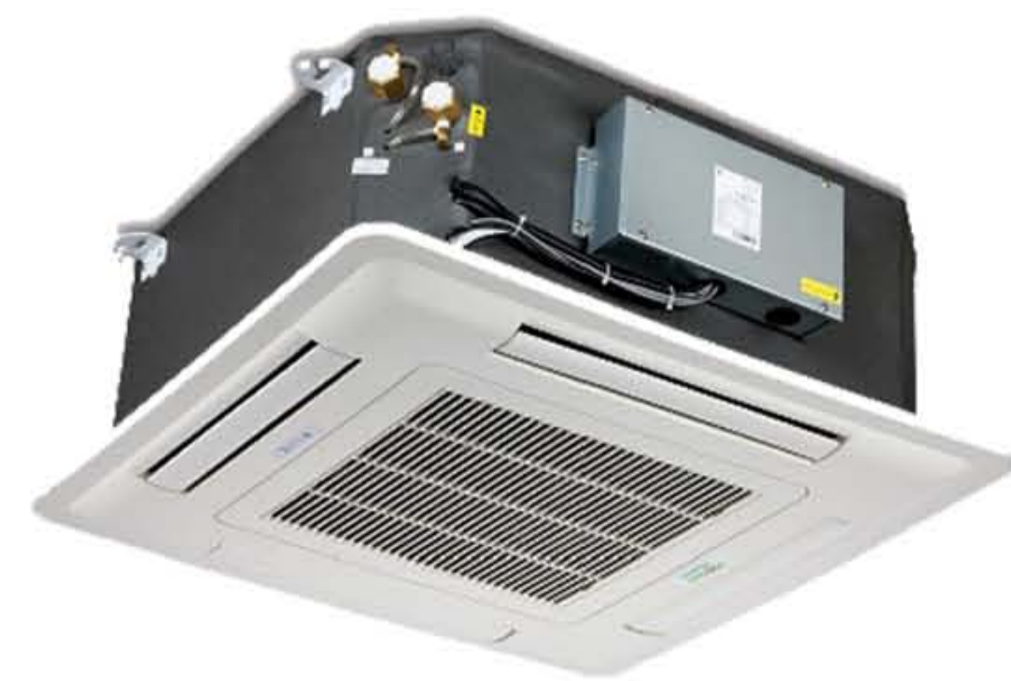
Chilled Water Cassette