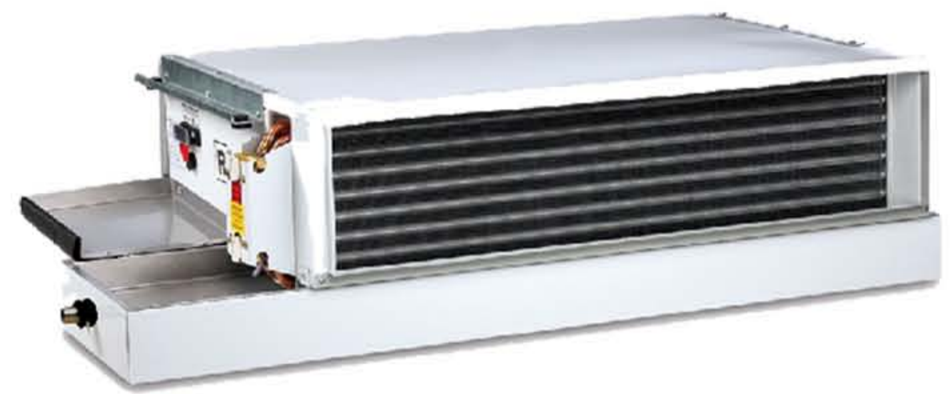
Double Skin Fan Coil Unit*