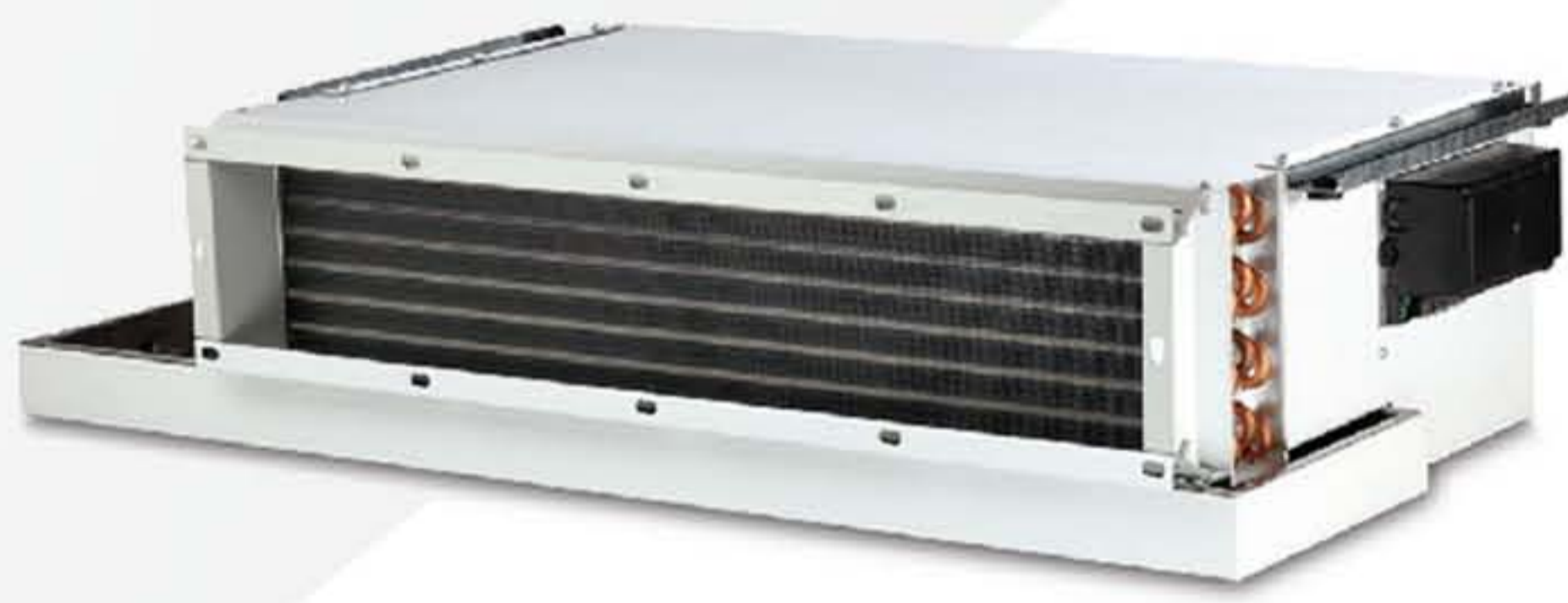
Single Skin DC Fan Coil Unit*