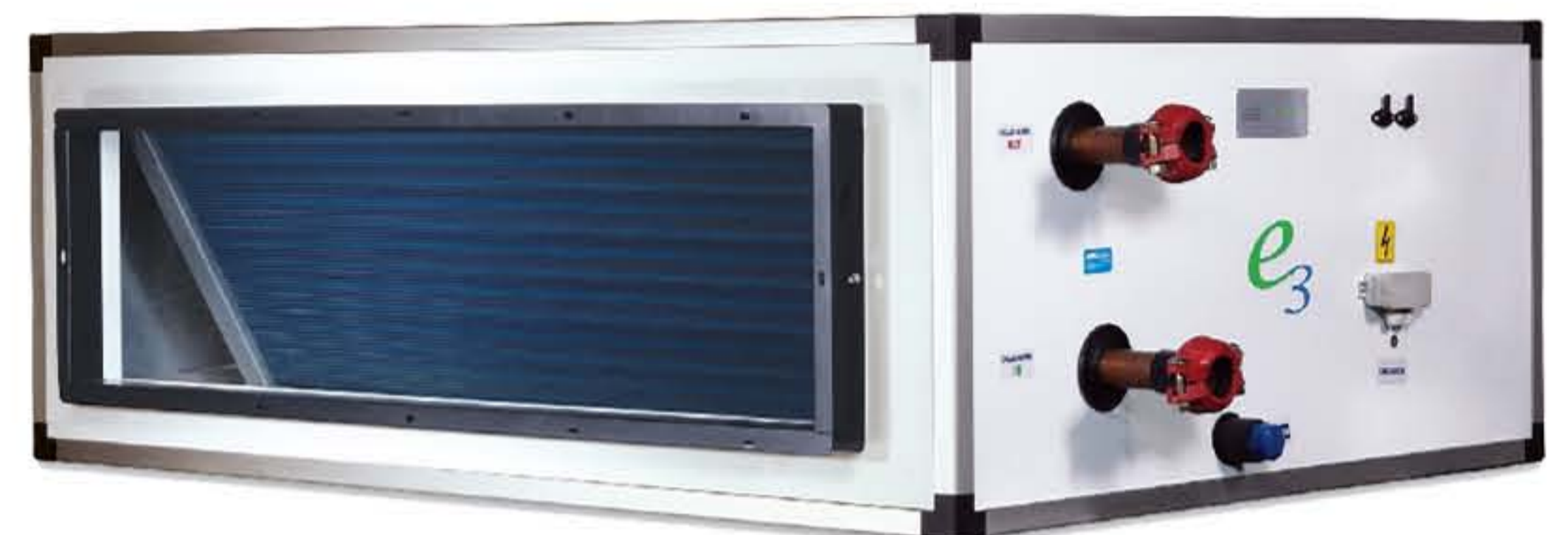
Ceiling Suspended Air Handling Units