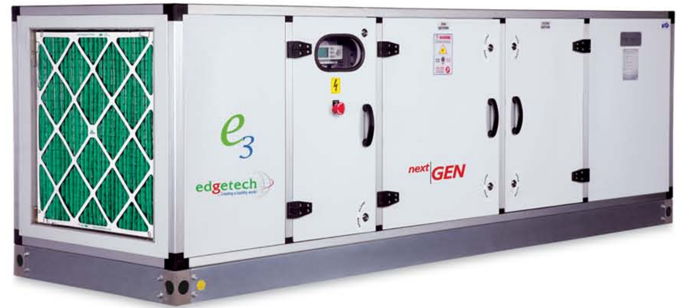
Air Purification System