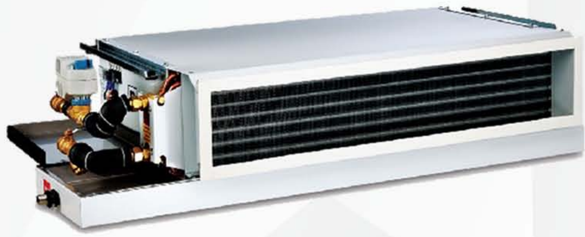
Single Skin Fan Coil Unit*