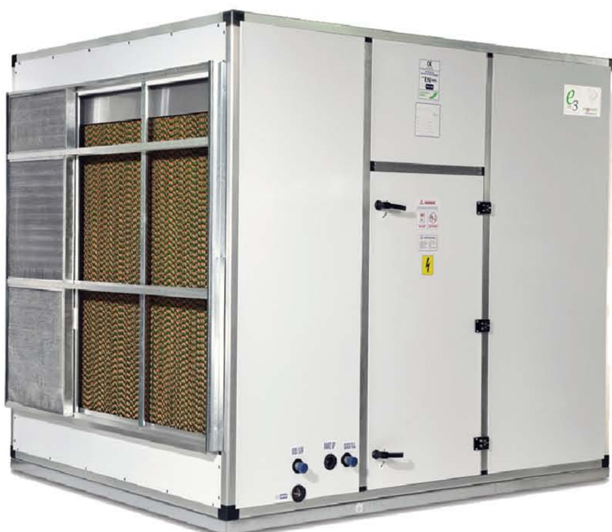
Evaporative Cooling Unit Pad Type : Single Stage Double Stage : Direct & Indirect