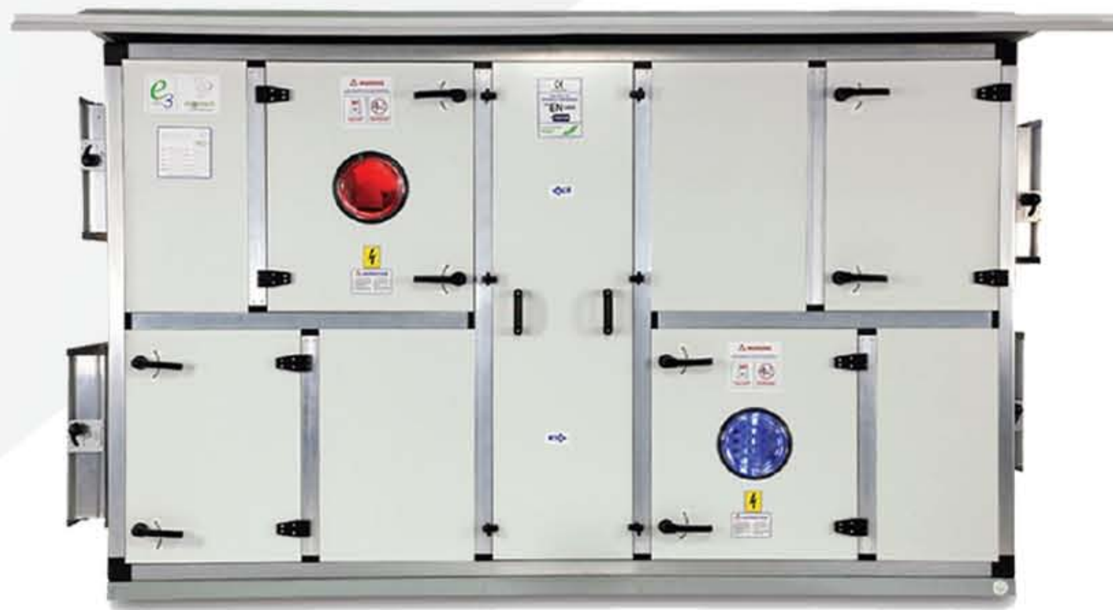
Energy Recovery Units